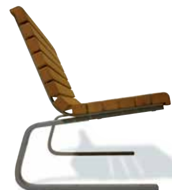
NUSSER In-Line Bench LIGUS for the Landesgartenschau in Öhringen

Custom made bench based on the LIGUS bench to follow a curved line. Individual sections are cut to fit the winding layout. Frame is hot dip galvanized, optionally powder coated. Seating is FSC® hardwood or Douglas fir.