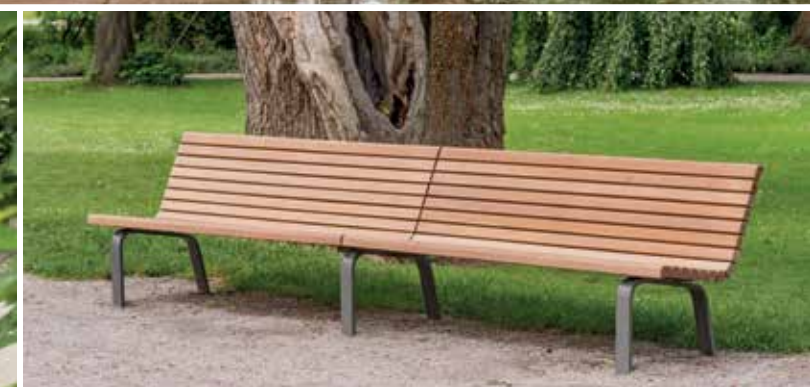
NUSSER LIGUS II with backrest

Bench based on the LIGUS bench with a stand for embedding. Bench with frame made from flat bar steel, hot dip galvanized, optionally powder coated in DB 703 (dark metallic gray). Type of wood: FSC® hardwood or Douglas fir.